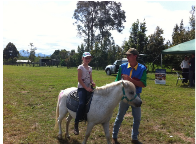
One of the local kids enjoying a Pony Ride at the Open Day

hard to get started as soon as possible with construction.